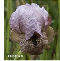
'Tekoah', 2002 OGB