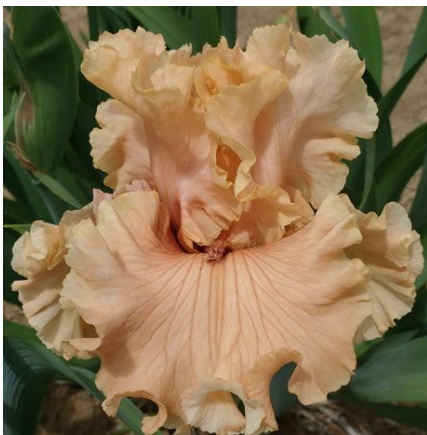
YOU MAKE ME BLUSH (Sutton 2022) TB, 35", ML. Standards honeysuckle, slight red-violet flush up midrib; falls same, greyed purple in throat, veined darker; beards terra cotta; ruffled; sweet fragrance.