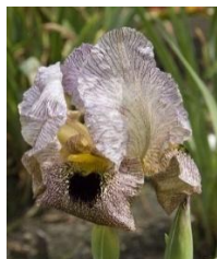
'Eglon'; 2001 OGB

'Glacier Sunrise' OGB ( James Whitely, R. 2006). Seedling W03-07A. AB, 26" (66 cm). Early midseason bloom. Standards white, domed, strong midrib; style arms white, underside tinted gold yellow; Falls white, recurved; large semi-circular orange-mahogany signal; beards wide yellow. 'Masada's Glory' X unknown. (NO PICTURE)