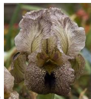
'Kedesh', 2001 OGB