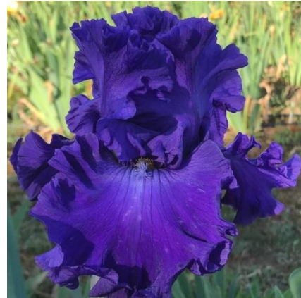
SONOMA BLUE (Begley via Ford 2022) TB, 34”, M. Deep blue-violet self; beards yellow in throat, ends pale blue; slight spicy fragrance.

(Iris photos and descriptions are courtesy of commercial hybridizers and wiki.irises.org .)