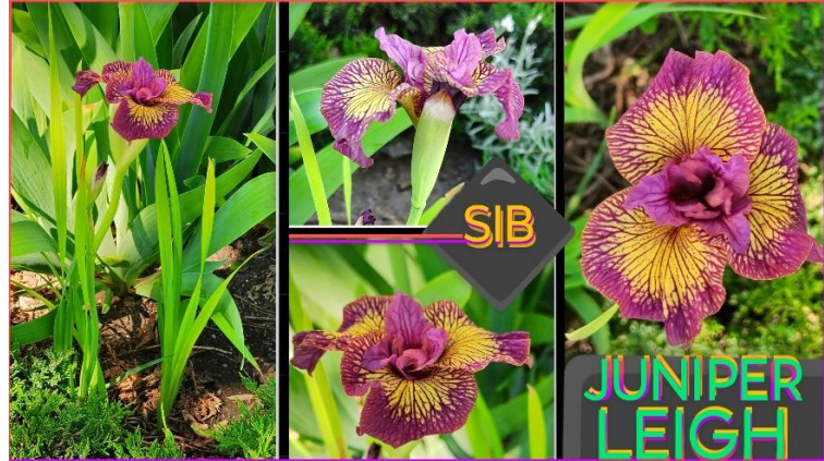
SAMPLE entry – Juniper Leigh, SIBERIAN

We can walk you (talk you) through it or accept your photos and help you combine them for entry. If you live close enough, we can even come to you to help you prepare your pictures and submit them.