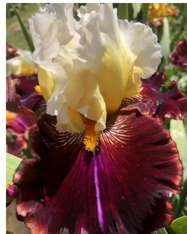
LIGHTED PATH (Ford 2023) TB, 30", E-M. Standards white flushed yellow, yellow veining, dark veining in throat; falls dark red violet, lighter pink-violet belly stripe, darker veining, edges lighter, dark wire rim, white hash marks around beard; beards cadmium orange, tipped violet in throat; slight sweet fragrance.