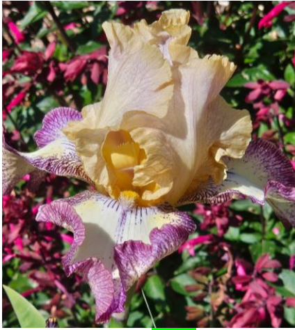
UKULELE GIRL (Cadd 2025) TB, 43", EM, (RE). Standards light creamy yellow, darker at base, delicate light brown veins; falls white ground, red-purple plicata, with the touch of creamy yellow, delicate lines and purple dots, less colored in center, edged 1/16" brown-purple band; beard hairs based white, tips yellow; pronounced musky fragrance. It may rebloom, but it is not a consistent RE.