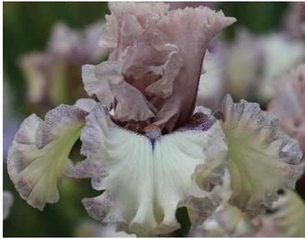
SUCH A SWEETHEART (Johnson 2022) TB, 36", M. Standards light pink ground, overall light lavender plicata dots; falls cream, deep violet hafts, faint light violet dotted edge, deep violet dart below beard; beards tangerine in throat, lavender in middle and end, tips orange and violet; sweet fragrance.