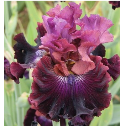
MYSTERY MAN (Keppel 2023) TB, 40", EM. Standards perilla purple blended coronation. Falls dark purple at edge, velvety deeper purple remainder, white near beard; beards huckleberry base, tips mustard.