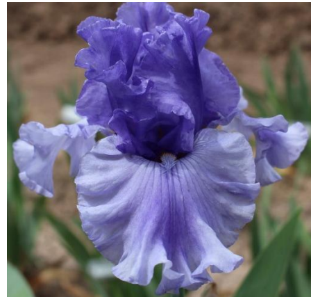
NEW MEXICO SKY (Dash 2022) TB, 32", M. Standards and style arms sky blue; falls powder blue; beards orange to powder blue; slight fragrance. HM 2024.