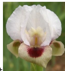
'Masada's Glory', 2001 OGB+