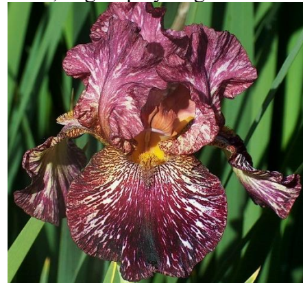
SIR LINES A LOT (Tyson 2022) TB, 33”, M & RE. Standards red-purple with off white streaks, streaks bolder on inside; falls darker red-purple, off white and cream streaks, yellow hafts with red-purple veins; beards cream-white, yellow in throat; slight spicy fragrance.