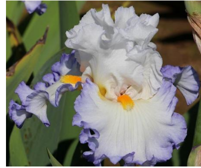
SUPER SIZED (Johnson 2022) TB, 36", E-M. Standards pure white; icy blue-white with a sky blue diffused rim; beards bright yellow-orange, white tip; slight fragrance.