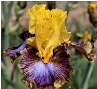
SHIFTING GEARS (Keppel 2023) TB, 36", E-M. Standards chrome lemon; falls pale lavender center ground, progressively heavier and darker striated overlay blended chippendale yellow veining, outer 1/4" lime yellow to brass edge; cadmium yellow.