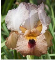
'Peresh', 2001 OGB