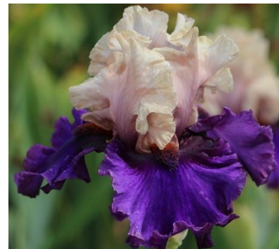
NIGHT DANCER (Johnson 2023) TB, 35”, M. Standards rose pink centers, flesh pink edge; falls rich purple, near black purple hafts; beards deep purple base, burnt orange tips; pronounced sweet fragrance.