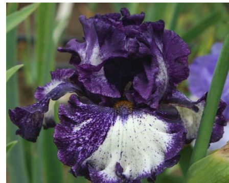
MAKE UP YOUR MIND (Black 2024) TB, 33", EM. Standards white, wide dark charcoal purple nearly solid plicata band midrib, random dotting over center; falls white, irregular dark charcoal purple broken color, solid and dotted, mottled plicata segments; beards mid purple base, dark sienna tips; slight sweet fragrance.