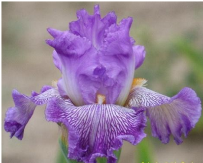
MIGRATION RUN (Schreiner 2024) TB, 31", M. Standards lavender-purple; falls streaked lavender-purple; beards orange; slight musky fragrance.