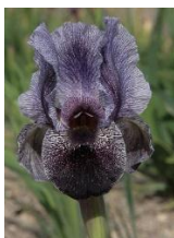
'King Jehu', 2003 OGB+