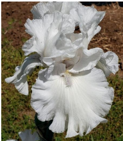
ANGEL OF THE GARDEN (Tasco 2022) TB, 34", M. White self; beards based blue, tips white, yellow in throat; sweet fragrance.