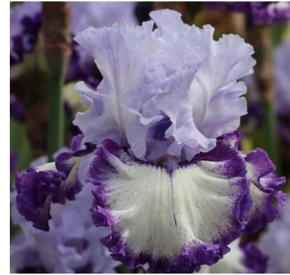
RUNNING IN CIRCLES (Johnson 2023) TB, 38", M. Standards light blue, white center; falls white, thick blue-lavender band and plicata dots, deeper blue hafts, few random dots on the white ground; beards orange throat, lavender middle, blue end; sweet fragrance.